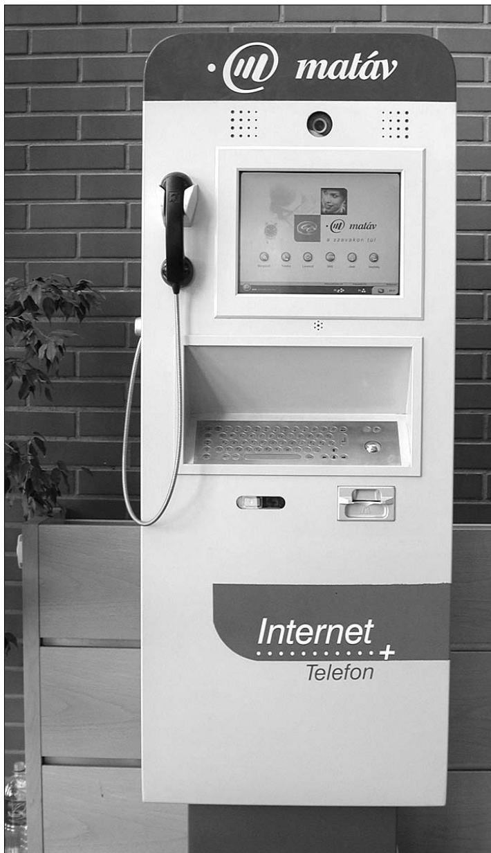
The hungarian web terminal developed by László Bortel (Matáv-PKI FI)

The charts of figure analysis, tariffs and advertising messages are provided by the PMS 150 supervisory system.